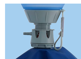
Inlet valve with oxygen reservoir.