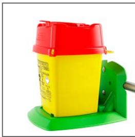
Plastic trolley holder