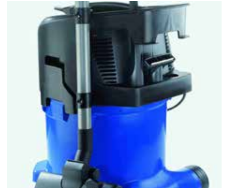
The design lets you have your accessories on hand in a secure way.