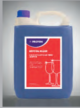
Krystal Klear - Glass Wash Rinse Aid 2 x 5 L, 10 kg, 700112