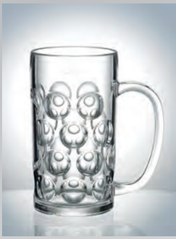
Beer Mug 0,5 L. 57 cl, 208 g, 200301