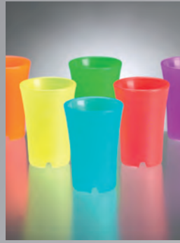
Shot MIX Frosted, various colours 3 cl, 19 g, 100104