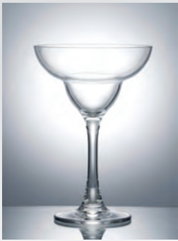
Margarita 34 cl, 127 g, 300108