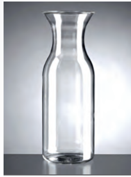
Decanter 1 L. 1 L, 117 g, 500101