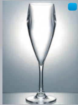
Champagne Epernay 24 cl, 135 g, NSG 300112