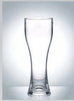
Weisbeer 0,3 L. 35 cl, 164 g, 200401