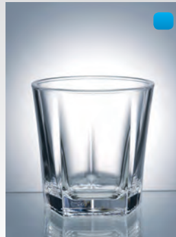
Double Jasper 42 cl, 160 g, NSG PS-29