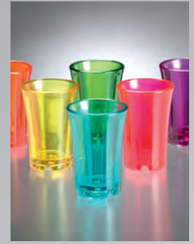
Shot MIX clear, various colours 3 cl, 27 g, 100202