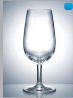
Wine Taste Glass 20,5 cl, 62 g, NSG 300196