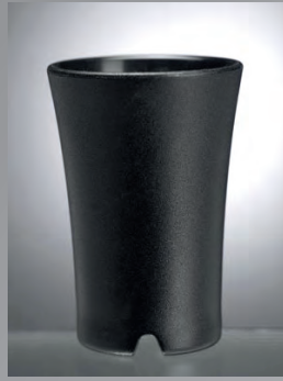
Shotglass Frosted, Black 3 cl, 19 g, 100103