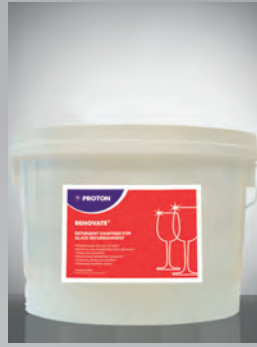
Renovate Powder 2,5 kg, 2,5 kg, 700103