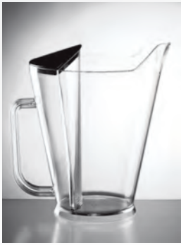
Jug with cold 1,5 L. 1,5 L, 139 g, 500100