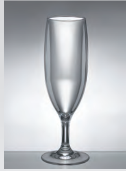
Champagne 18 cl, 137 g, 300102