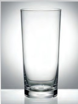
High Ball 33 cl. 33 cl, 98 g, 200105