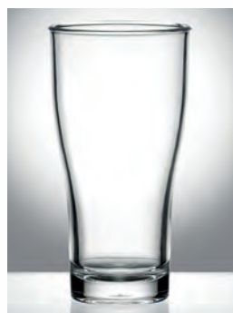
Tulip Large 57 cl. 57 cl, 187 g, 999908