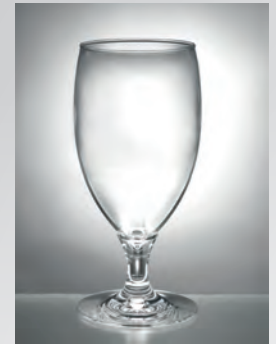
Beer glass on foot, Large 52 cl. 52 cl, 232 g, 200104