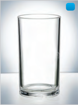
Shotglass High Ball 6 cl. 6 cl, 31 g, NSG 100213