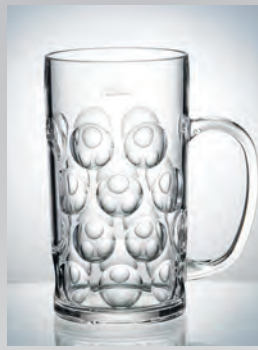
Beer Mug 1 L. 110 cl, 325 g, 200302