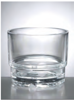
Whiskey 15 cl, 71 g, 400101