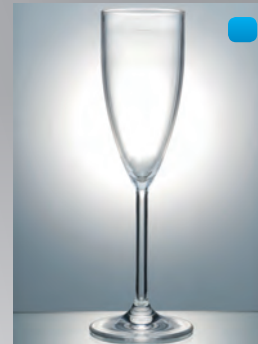
Champagne Flute 22 cl, 78 g, NSG PS - 7