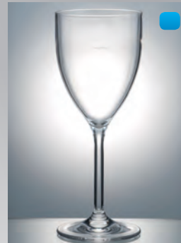
Wine 25 cl. 29 cl, 82 g, NSG PS - 6