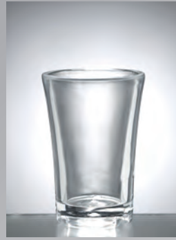
Shotglass Clear 3 cl, 27 g, 100201