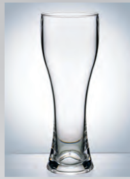
Weisbeer 0,5 L. 57 cl, 247 g, 200402