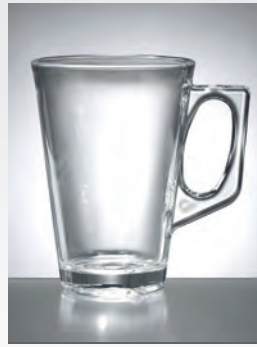
Coffee 25 cl, 114 g, 400100