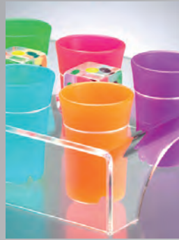
Shot Game incl. glass, tray and dices, 600102