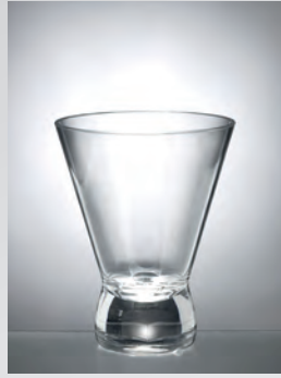
Cocktailglass Large 40 cl. 40 cl, 166 g, 300101