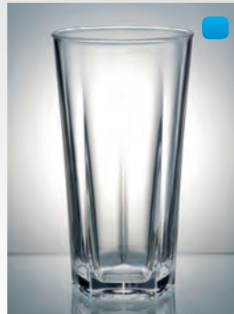
Jasper High Ball 33 cl, 115 g, NSG PS-24