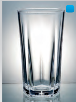
Jasper High Ball 46 cl, 164 g, NSG PS - 11