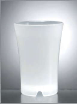
Shotglass Frosted, White 3 cl, 19 g, 100102