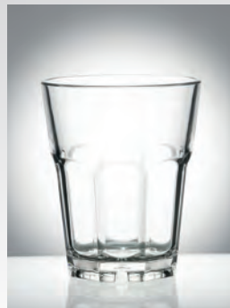
Granity ROCK Large 37 cl. 37 cl, 132 g, 200109