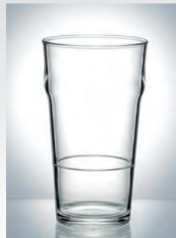
Nonic 0,5 L. 57 cl, 147 g, 200202