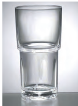
Universal Large 46 cl, 165 g, 200116

SEE ALL products, dimensions and download pictures on www.glass4ever.com