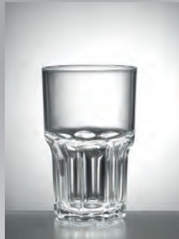
Granity Medium 32 cl. 32 cl, 108 g, 200101