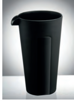
Pitcher 1 L. 1 L, 108 g, 500103