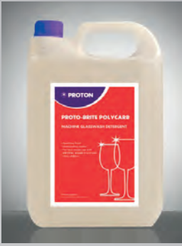
Protobrite - Glass Wash Detergent 2 x 5 L, 10 kg, 700102