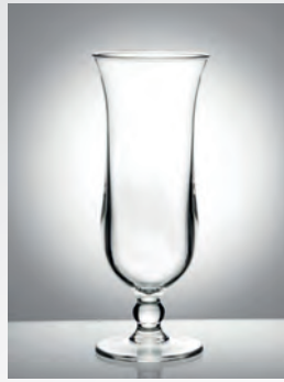
Hurricane 40 cl, 182 g, 300109