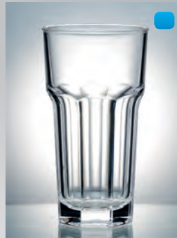
Granity Schimiddy 39 cl. 39 cl, 162 g, NSG PS - 5