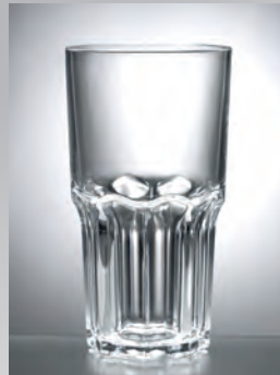
Granity Large 47 cl. 47 cl, 151 g, 200102