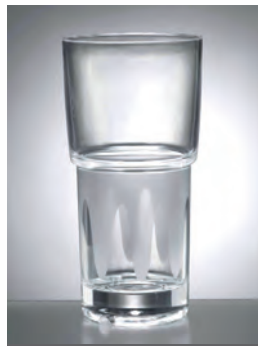
Universal Medium 30 cl, 106 g, 200118