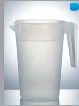
Pitcher, white 1,5 L. 1,5 L, 159 g, NSG 500102