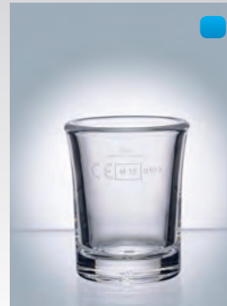
Shotglass Clear, 2 cl. 2 cl, 26 g, NSG 100205