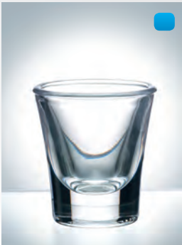
Shotglass clear 3 cl. 3 cl, 52 g, NSG PS - 8