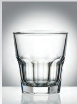
Granity ROCK Medium 24 cl. 24 cl, 123 g, 200108