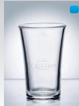
Shotglass Clear, 2/4 cl. 4 cl, 28 g, NSG 100206