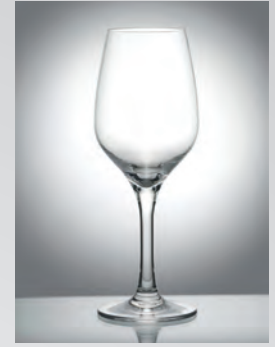
Wine 40 cl. 40 cl, 105 g, 300106