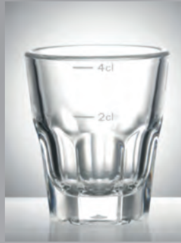
Shot Granity Clear 2/4 cl. 4 cl, 39 g, 100204