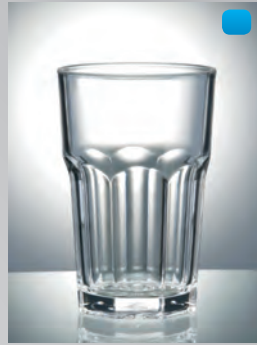
Granity Medium 33 cl. 33 cl, 117 g, NSG 200111