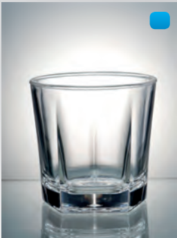
Jasper Rock 30 cl, 125 g, NSG PS - 10