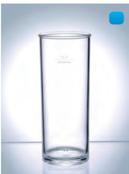
Köln Stange 24 cl. 24 cl, 77 g, NSG 200115