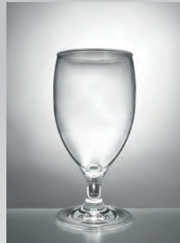
Beer glass on foot, Medium 32 cl. 32 cl, 140 g, 200103