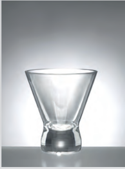
Cocktailglass Medium 20 cl. 20 cl, 154 g, 300100