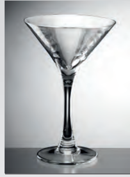
Martini 20 cl, 124 g, 300103