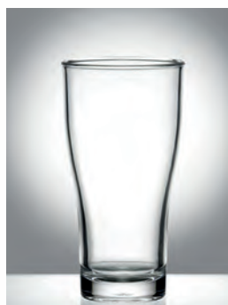
Tulip Medium 42,5 cl. 42,5 cl, 144 g, 999907