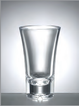
Hot Shot glass 3 cl, 56 g, 100203